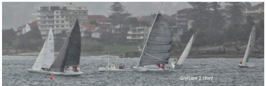
Division 1 start