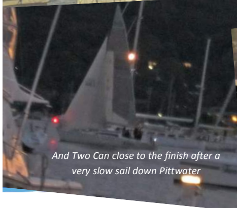
And Two Can close to the finish after a very slow sail down Pittwater