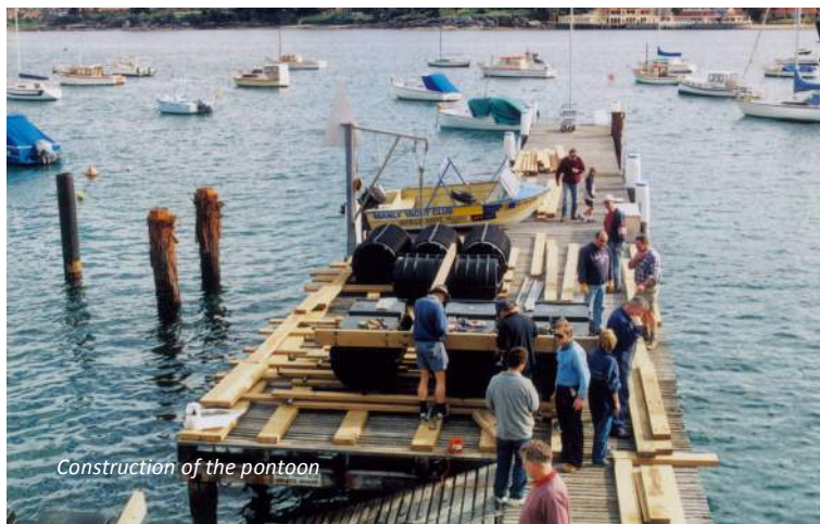
Construction of the pontoon

Much of the structure was fabricated at Phil Vidler's premises at Brookvale and transported to the deck where the pontoon slowly took shape. On a wet and windy night in August in 2001, at 10.30pm during the highest tide of the year, it was gently coaxed into the water, and guided by ropes into position between the piles.