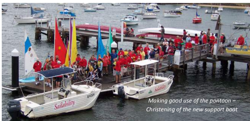
Making good use of the pontoon – Christening of the new support boat