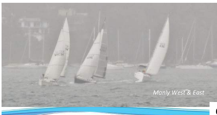
Manly West & East