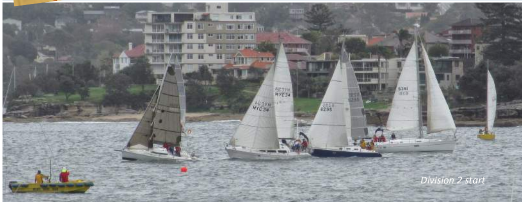
Division 2 start