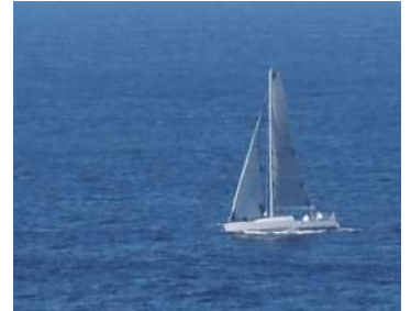
The "fleet" passing South Curl Curl; Pensive takes the lead while James Arthur struggles with the kite; Torquil some way behind and Two Can too far away to be seen