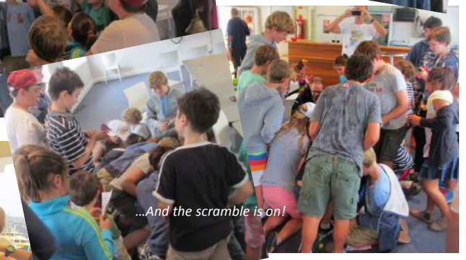
...And the scramble is on!