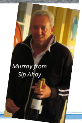
Murray from Sip Ahoy